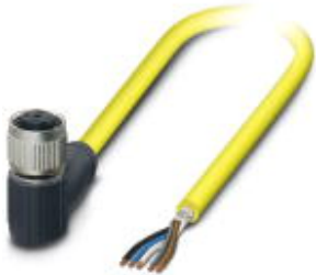
Sensor/Actuator cable, 5-position, PVC, Yellow RAL 1021, shielded, Free cable end, on Socket angled M12-SPEEDCON, A-coded, Cable length: 5 m

Please be informed that the data shown in this PDF Document is generated from our Online Catalog. Please find the complete data in the user's documentation. Our General Terms of Use for Downloads are valid ( http://download.phoenixcontact.com )